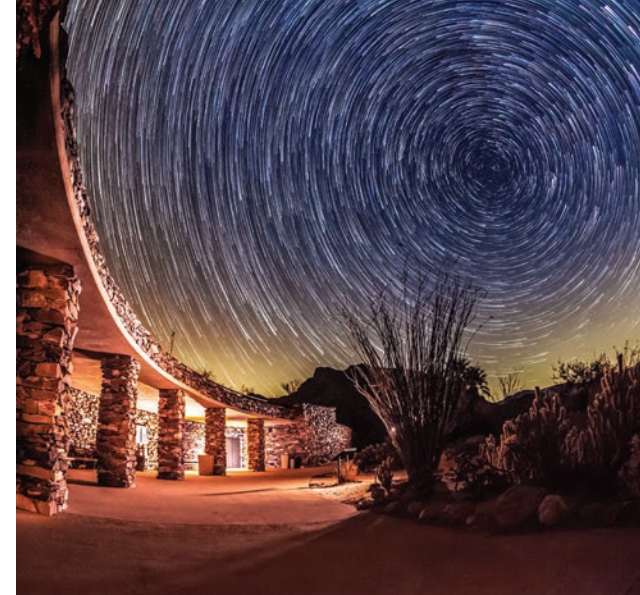
Stars seen over the Anza-Borrego visitors center. TONY PRINCE

Borrego Springs is considered a Dark Sky Community, which means it's a great place to see stars. Plus, there are accommodations for all budgets and styles. Stanlunds Inn & Suites is a recently renovated desert classic. The Palm Canyon Hotel & RV Resort has vintage Airstreams for rent. Or, you can pitch your own tent out in the backcountry. Hire California Overland for off-road tours and overnight camping set-ups complete with chuckwagon dinner and breakfast.